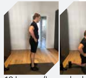
10 Lunges (Lower body)