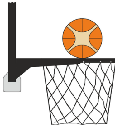
Diagram 3 Ball is in contact with the ring

31-19 Statement: An interference violation is committed by a defensive or offensive player during a shot for a field goal when a player touches the basket (ring or net) or the backboard while the ball is in contact with the ring and still has a chance to enter the basket.