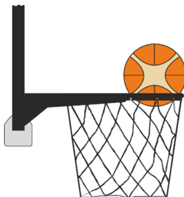
Diagram 4 Ball is within the basket

31-24 Statement: It is an interference violation if a defensive player touches the ball while the ball is within the basket.